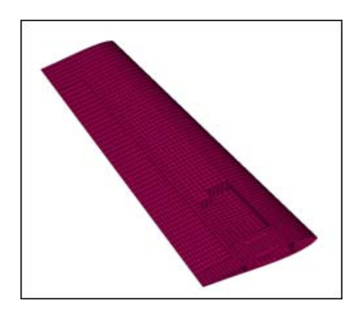
Tail Optimization: 3% Mass Savings